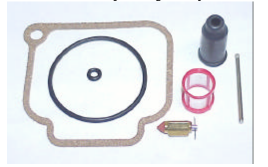
Figure #1 – Bing Carb Rebuild kit #13503 contains most everything you need to do the job for less than $30.

One of the most over looked and misunderstood parts of the powerplant is the Bing Model 54 Carb. While a lot of guys follow the Scheduled Maintenance plan religiously and need to be commended for it, many do not really understand what to do every 50 hours when the plan calls for "Clean Carburetors and check for wear". The same round slide Carb is used on all two stroke engines from the 277 to the 618, the only difference being the jetting found in the recommending jetting chart. This month we'll discuss the things to look for when maintaining your Carbs, the parts you need to have on hand before you get started, and why using oil injection instead of premix actually will considerably extend Carb life.