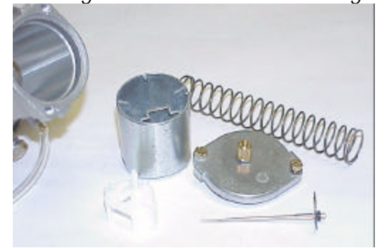
Figure # 6 – The top end parts are accessed by removing the two screws on the Carb top plate.

Inspect main jet for blockage. It is considered rare but if the #261-625 Sleeve Screen (red and white plastic screen that surrounds main jet tube) is installed improperly, chips from the plastic can block the main jet passage causing a lean-overheat condition. If you experience such an event, immediately check the main jet for blockage being sure to disturb the crime scene as you conduct your investigation. At no time should you run without this screen, as it is necessary to stabilize the fuel as it enters the main jet area. Use a blast of compressed air in both directions to clear jet passages. If you are a savvy operator you already are familiar with the importance of the proper main jet and probable have a selection of sizes on hand to compensate for changes of seasons and flying conditions. See Part #10 of the Proper Care & Feeding of the Rotax Motor "Tuning the Bing Carburetor" for more on the selection of the right main jet.