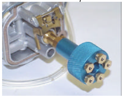
Figure #5 – The Bing Quick Change Wrench has both 8mm and 10mm hexes for both the main jet and the needle jet. The newer version has handy threaded ports for the storage of additional mains for seasonal jetting changes.

With a magnifying glass study the rubber tip of the valve and the internal seat for wear. This piece controls the fuel entry and the float level in the Carb. If not seating or closing properly the fuel will continue to flow causing the fuel to exit the overflow or vent tubes on either side of the Carb. A messy if not dangerous situation. The seat or internal brass cylinder is considered part of the main Carb body and non-replaceable. I understand that Bing does make a replacement kit for this item but the procedure is extremely difficult and not recommended for a novice or the faint of heart. Remove idler jet and inspect for blockage. Note the number stamped on the side. (40, 45, 50, etc.) Check the recommended chart found in the CPS catalog to see if this is the right number. Rarely should this part vary from the recommendation. Use a blast of compressed air in both directions to clear jet passages.