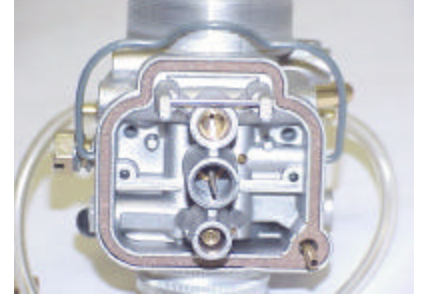
Figure #3 – With the float arm removed you can now inspect the passages including the inlet seat and jet passages.

from the top of float bowl. Don't start bending the float arms to change the level. Rather inspect the parts carefully for wear or float saturation. Check the float arm #861-190 for wear or flat spots at the contact point with the float. To check the alignment measure from the surface of the float bowl gasket to the float arm at the contact point. Should be right at 10.5 mm or 0 .412". Only after verifying that all parts are working properly, adjust the tab at the contact point of the valve to achieve proper float level.