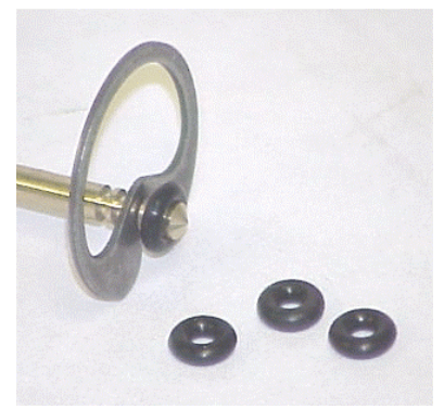
Figure #7 – Pay particular attention to the relationship between the tuning pin and the e-clip. These two parts will rotate and wear from vibration. The small o-ring shown here provides enough interference to stop this wear.

After a thorough inspection, reassemble the top of the Carb paying close attention that the e-clip is below the spring cup. Yes, it fits nicely inside the spring cup but this will cause an over rich mid-range. Years ago I had a guy call me from Ireland complaining that his buddies had worked on his carburetors and now his fuel consumption was nearly doubled. After listening to his heavy Irish accent for a while, I suggested he inspect his carburetors to see if the e-clip was on top the spring cup. A few days later he phoned to say everything was back to normal and that his buddies weren't going to get near his plane anymore.