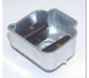
Figure #2 – The float level should be ½" or about 13mm from the top of the bowl with the floats removed.

Getting Started: General overhaul should be done at the same time as the engine or at the recommended 300 hours. Have on hand a Bing Carb Rebuild kit shown in Figure #1. Available for less than $30, it includes all the normal parts you replace including the 261-705 Valve w/ viton tip that sells for more than the entire kit when purchased separately by part number. Be sure to order one per Carb. Remove Carb(s) from engine and flip bail to remove float bowl. Inspect the float arm, floats, and the pins the float ride on for wear. Also check to see if both float rides at the same level in the fuel. Unequal floatation would mean the float is saturated and needs to be replaced.