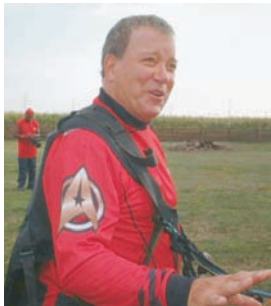
Left: William Shatner was 72 years old when he flew a powered paraglider for a charity event and helped the USPPA with its "Risk & Reward" safety video.

Tandem operations require significant knowledge and skill to operate safely since you must manage the motor, wing and another person at the same time. Many instructors use a wheel-equipped machine to make it easier.